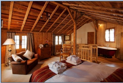
The Atelier (honeymoon suite)